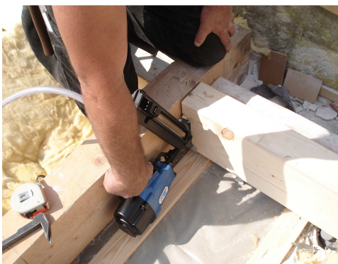
R60-943E: Easy to aim into tight edges.