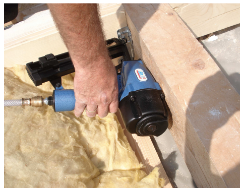
R60-943E: Small but powerful.