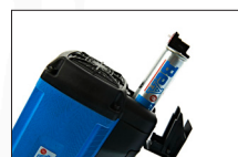
Easy fuel cell loading